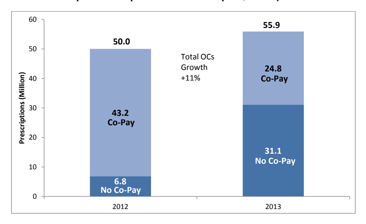
FIGURE 2: Dispensed Prescriptions for Oral Contraceptives, Privately Insured Women<sup>25</sup>