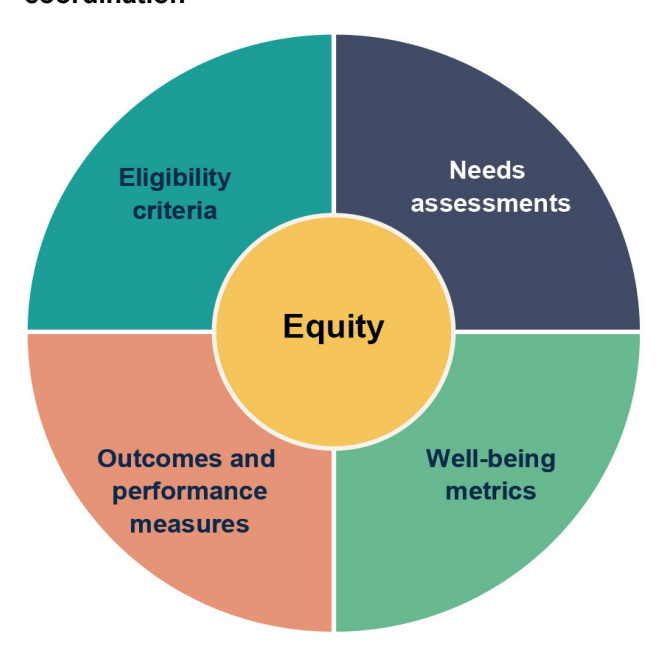
Exhibit 2. Key program elements for alignment and coordination