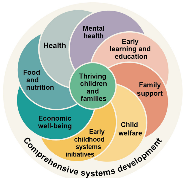
Exhibit 1. A vision of a coordinated, comprehensive early childhood system